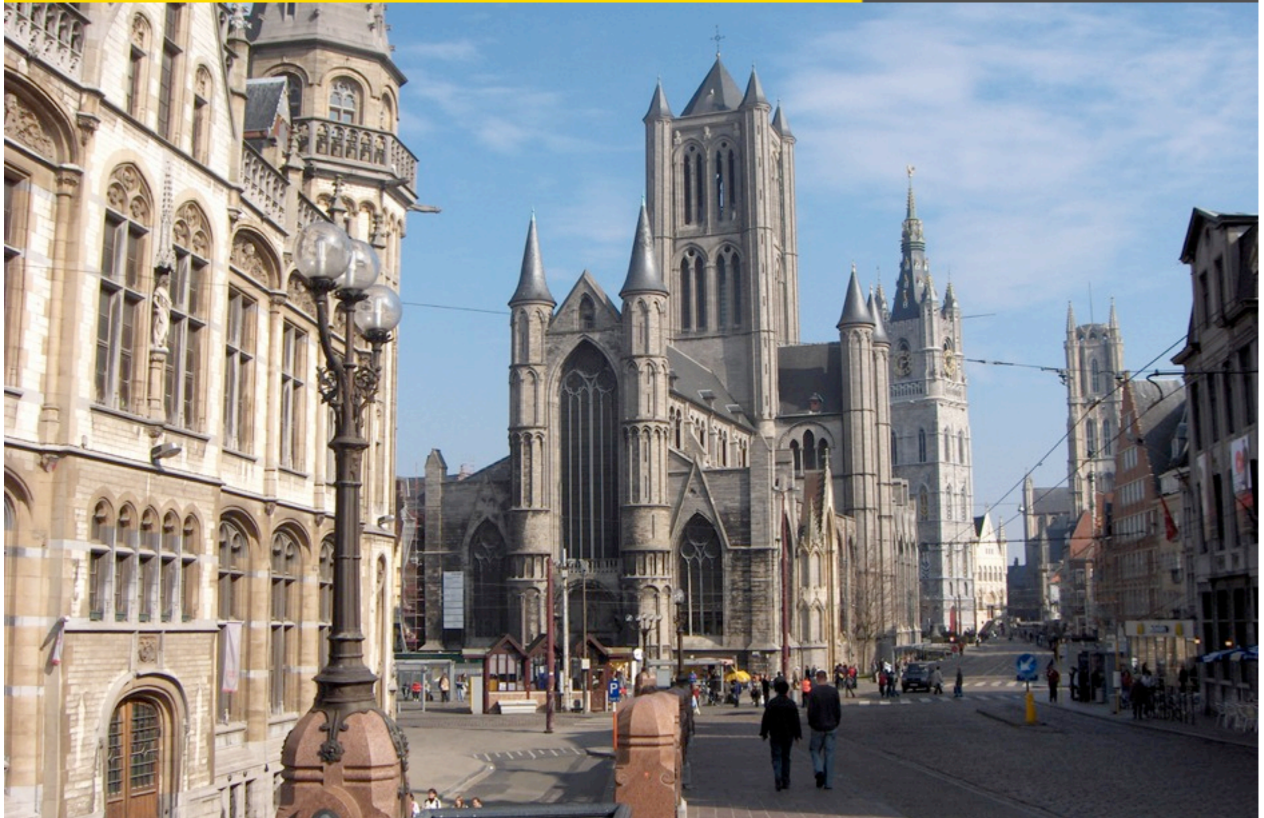
St Nicolas Church (1320) – Belfry (1380) – St Bavo Cathedral (1533)