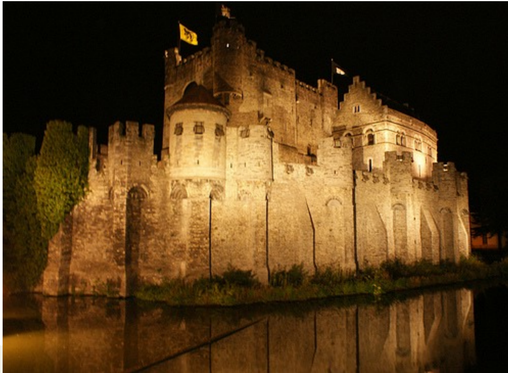
Gravensteen Castle (1093)